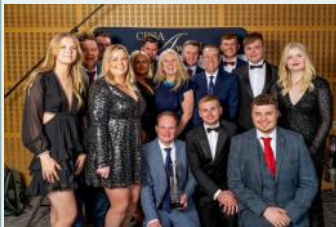
Barby Shooting School